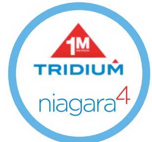
Tridium / Niagara